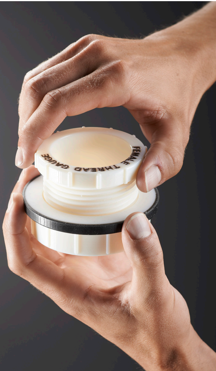
Threaded gauge prototype with male and female components

Use the Agilus30™ material family to create flexible parts and prototypes that can flex, bend, elongate and seal.