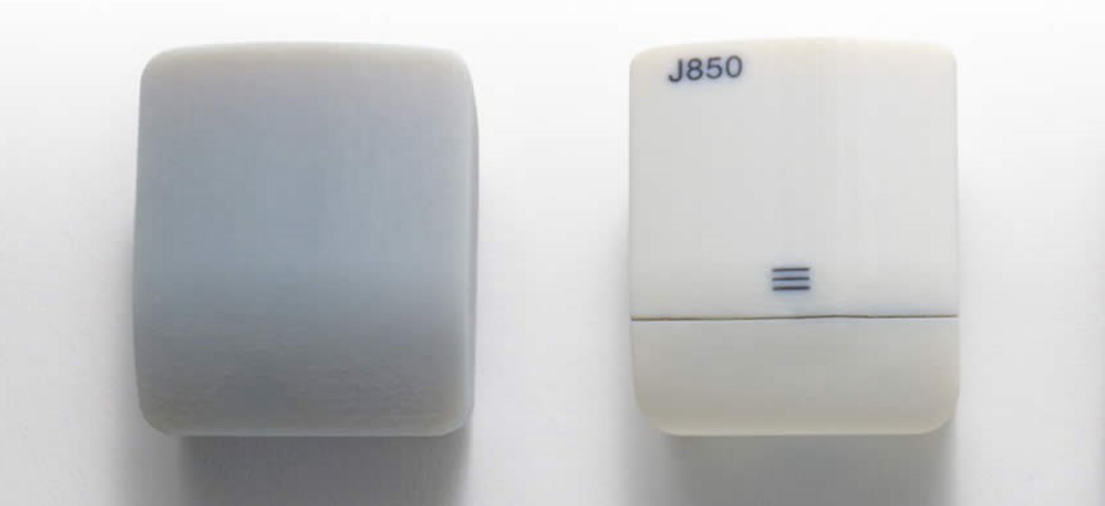
Earbud case prototypes 3D printed with DraftGrey (left) and VeroPureWhite (right)