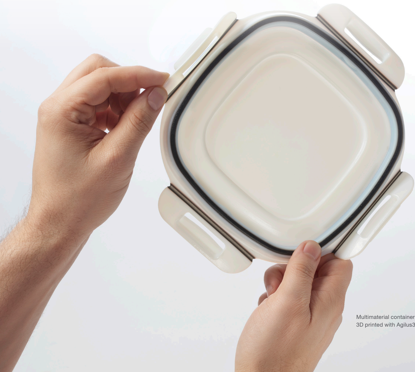
Multimaterial container lid prototype 3D printed with Agilus30 material

And if you need full-color capabilities down the line, the J850 Pro can be upgraded to meet those needs.