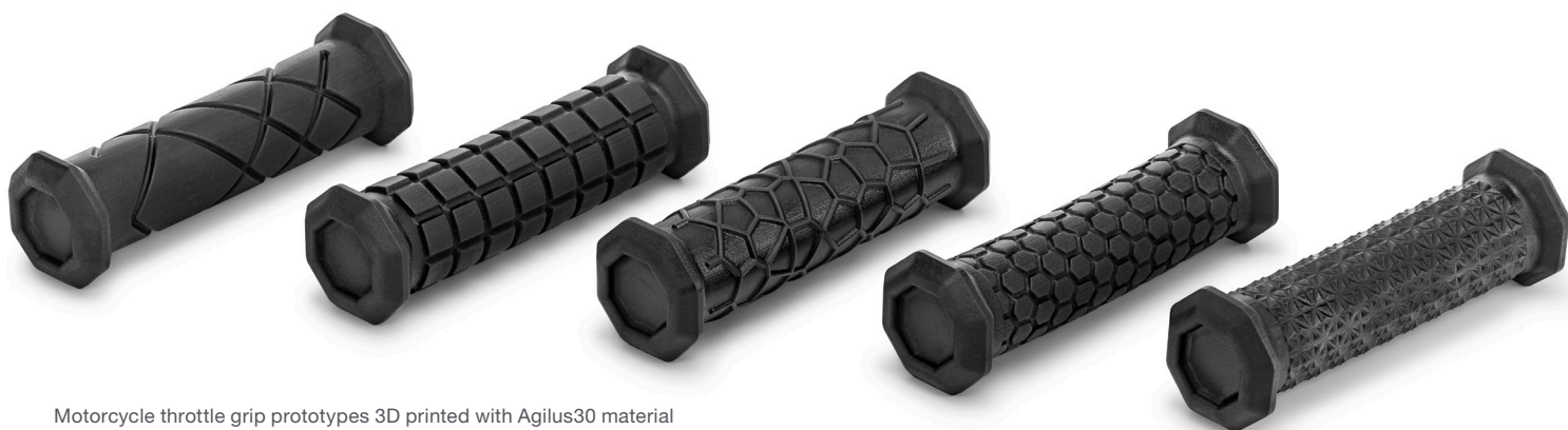
Motorcycle throttle grip prototypes 3D printed with Agilus30 material

With the J850 Pro, it's simple to create functional, multimaterial models that let you test and validate prototypes faster, and move through stakeholder review with ease. This leads to quicker decisions and approvals, helping you achieve product verification, increase throughput and save valuable time.