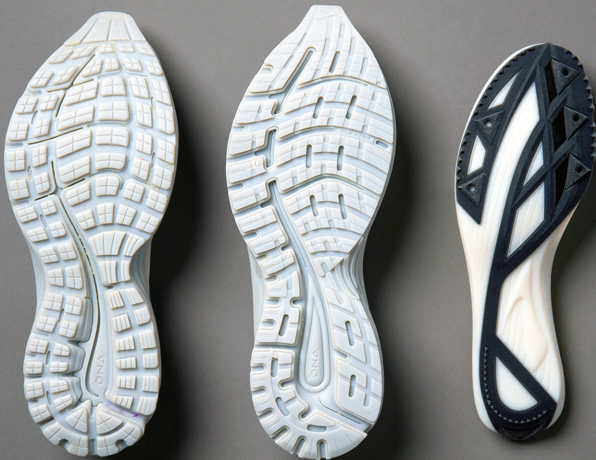
3D printed shoe midsole and outsole prototypes created by Brooks Running